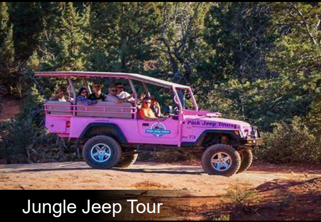
Jungle Jeep Tour