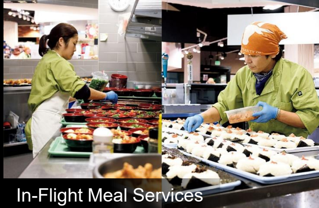
In-Flight Meal Services