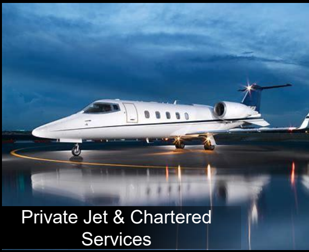
Private Jet & Chartered Services